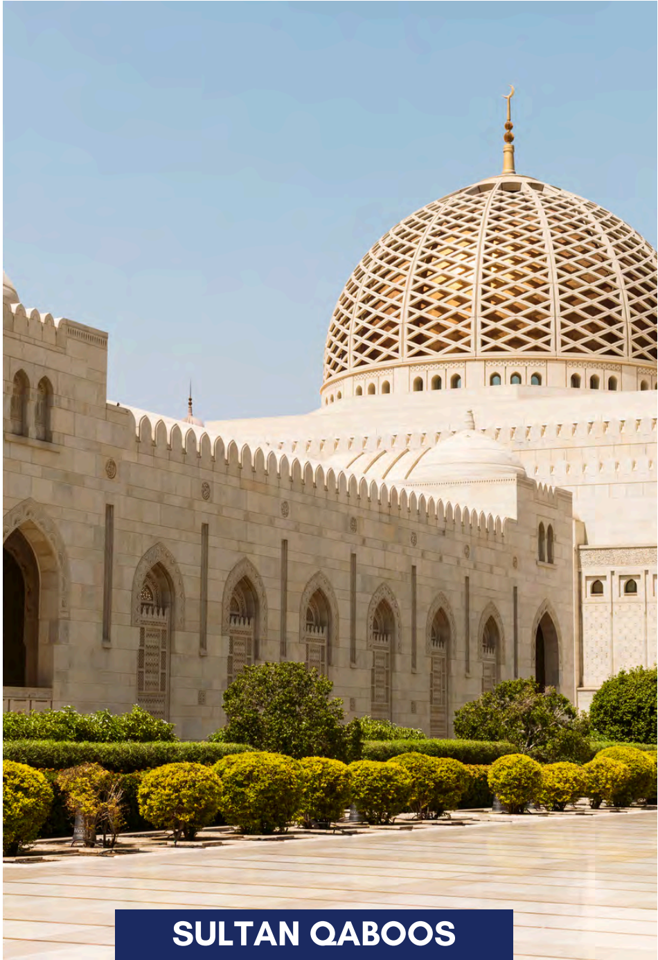
SULTAN QABOOS GRAND MOSQUE