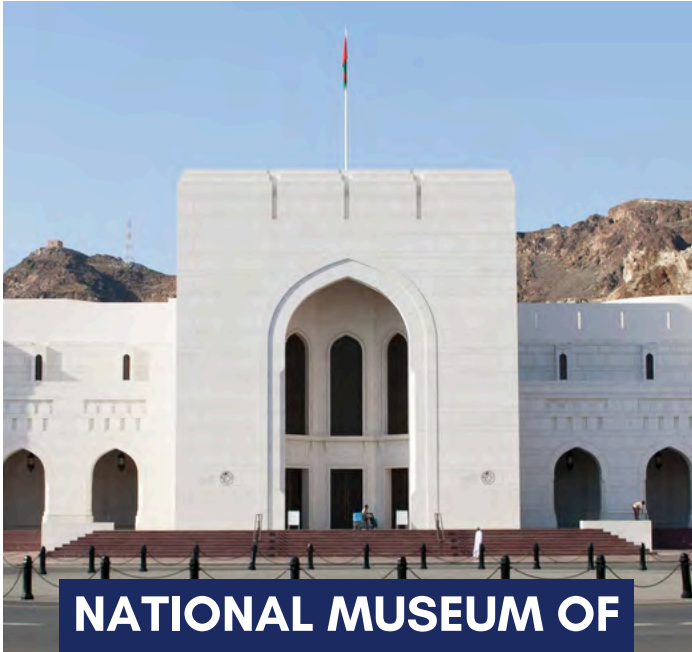
NATIONAL MUSEUM OF OMAN