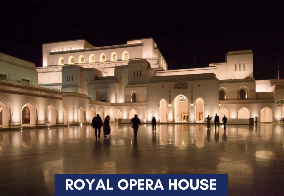
ROYAL OPERA HOUSE MUSCAT