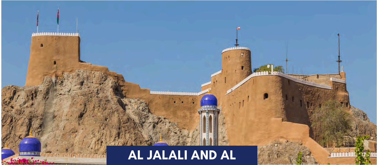
AL JALALI AND AL MIRANI FORTS