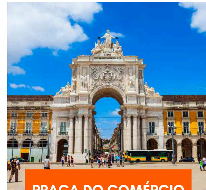
PRAÇA DO COMÉRCIO