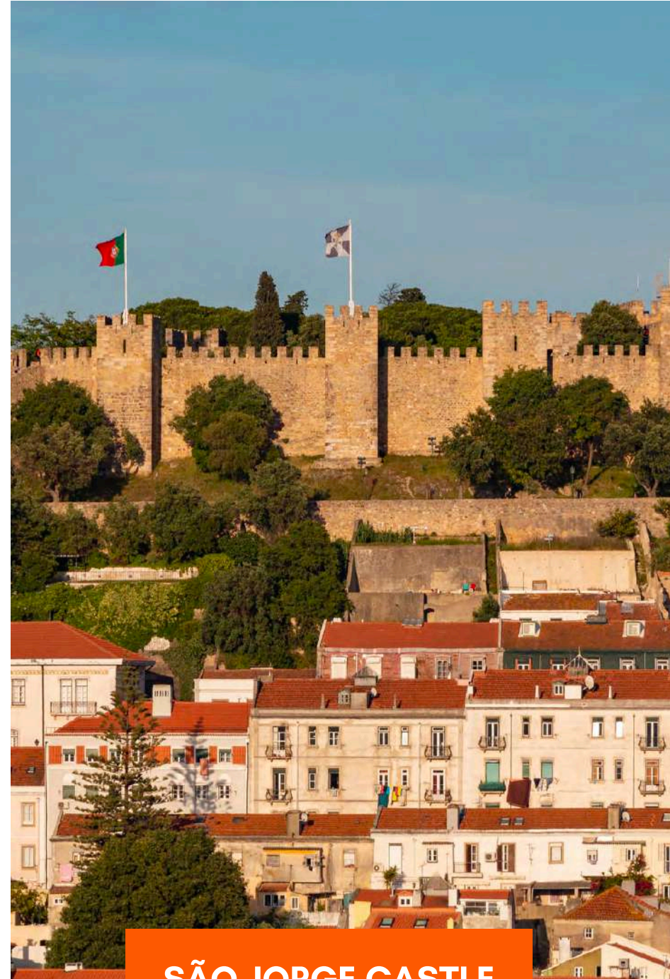
SÃO JORGE CASTLE