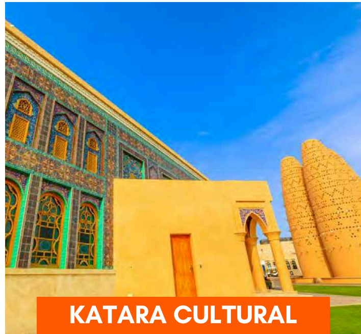
KATARA CULTURAL VILLAGE