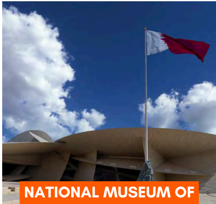
NATIONAL MUSEUM OF QATAR