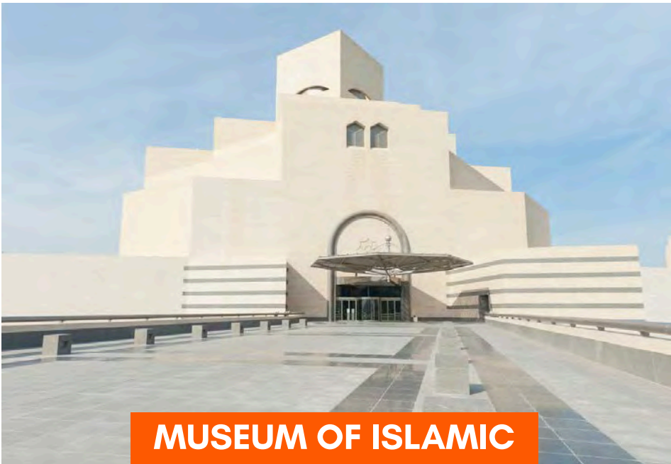
MUSEUM OF ISLAMIC ART