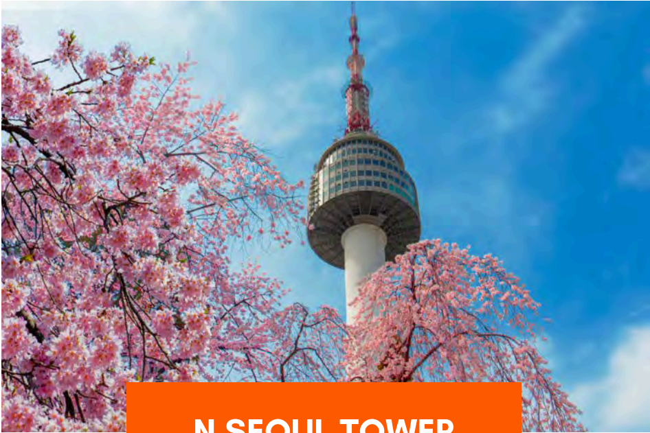
N SEOUL TOWER