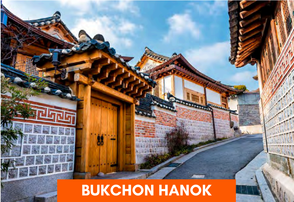
BUKCHON HANOK VILLAGE