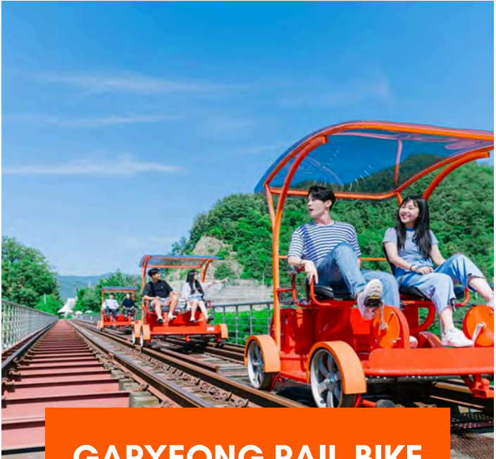
GAPYEONG RAIL BIKE