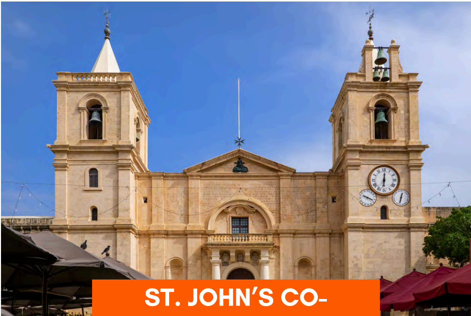
ST. JOHN'S CO-CATHEDRAL