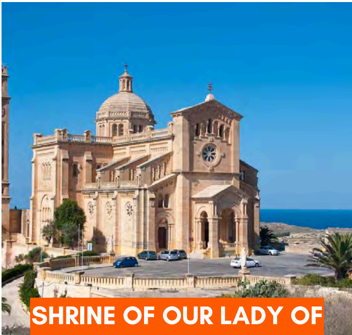
SHRINE OF OUR LADY OF TA' PINU