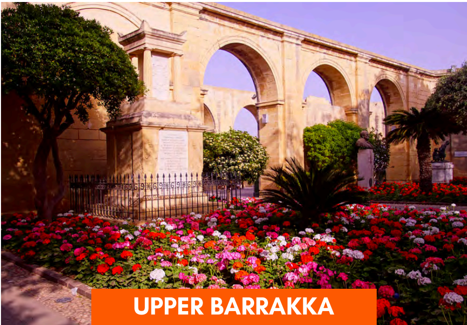
UPPER BARRAKKA GARDENS