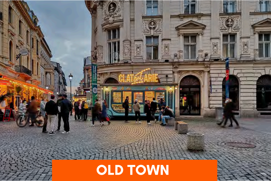
OLD TOWN (LIPSCANI DISTRICT)