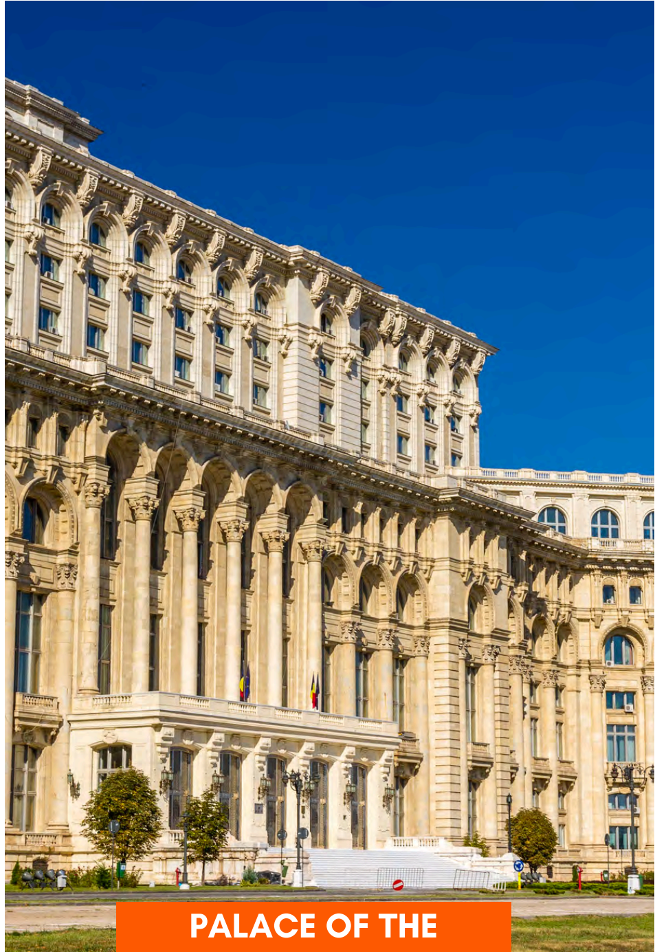
PALACE OF THE PARLIAMENT