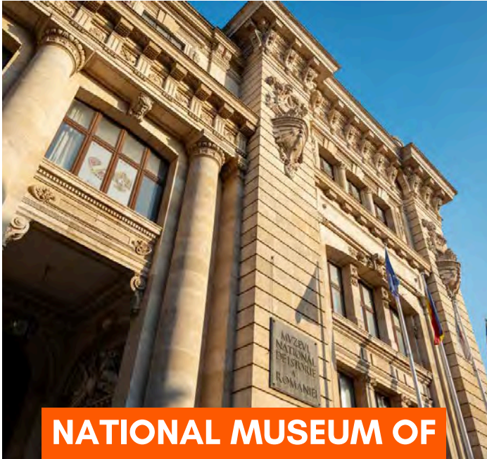
NATIONAL MUSEUM OF ART OF ROMANIA