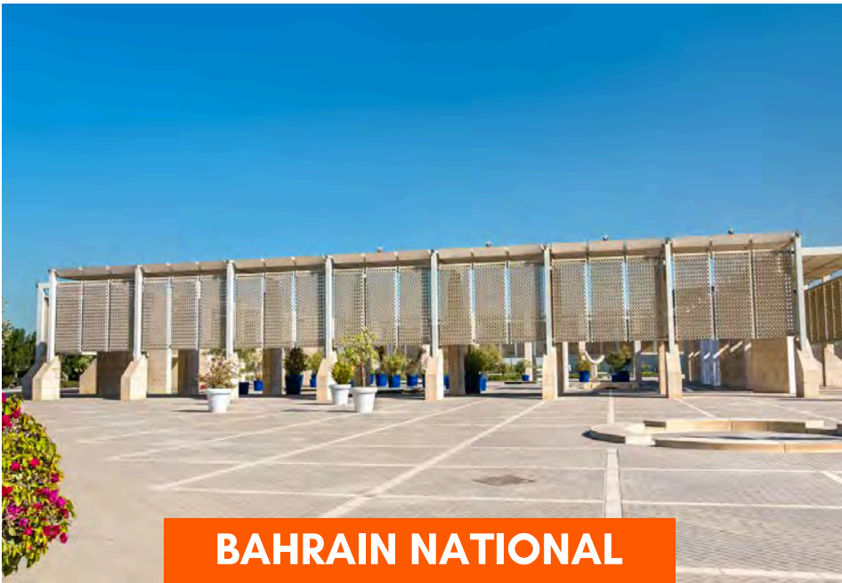
BAHRAIN NATIONAL MUSEUM