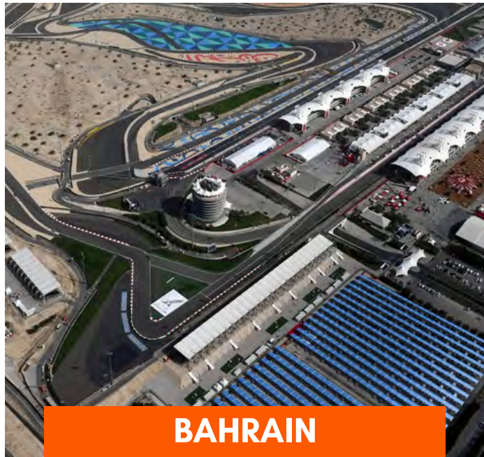
BAHRAIN INTERNATIONAL CIRCUIT