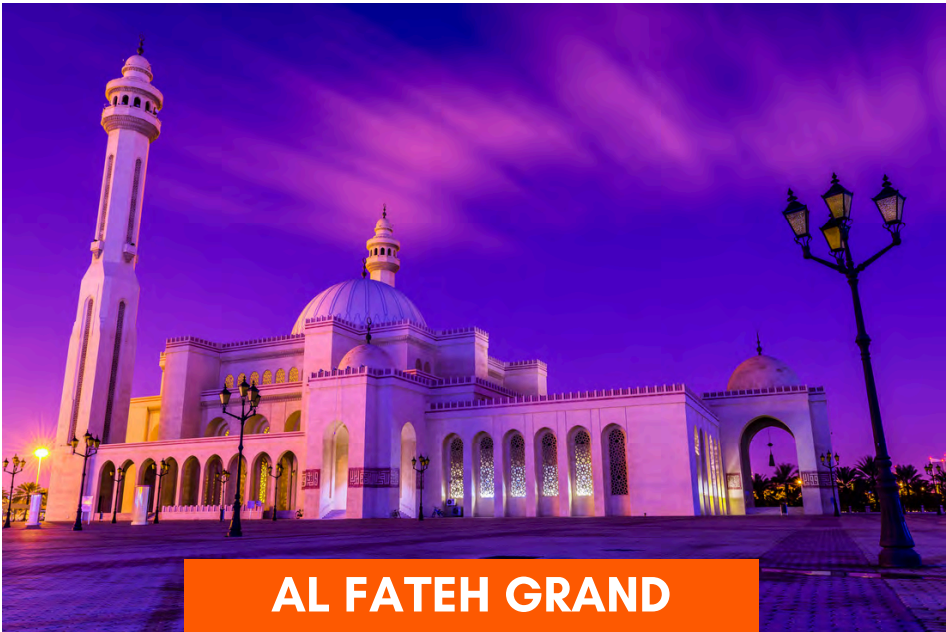
AL FATEH GRAND MOSQUE