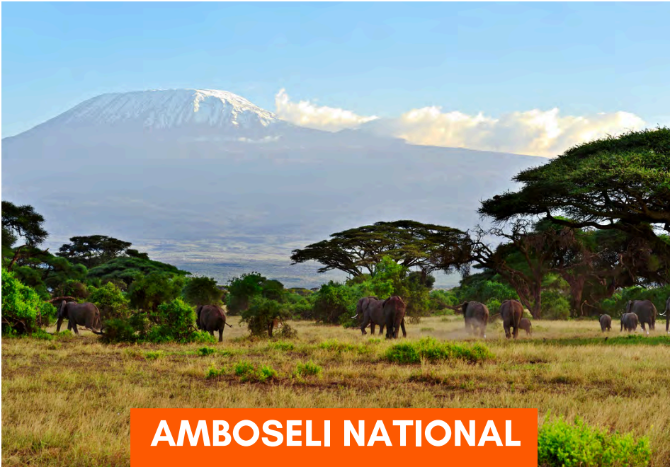
AMBOSELI NATIONAL PARK