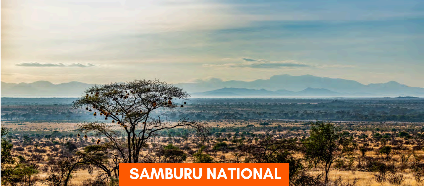
SAMBURU NATIONAL RESERVE