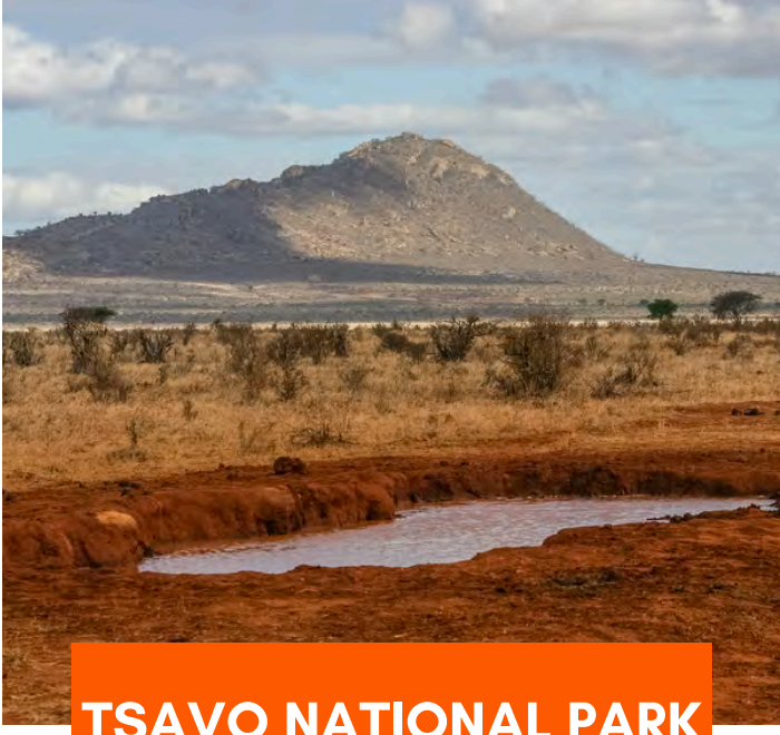
TSAVO NATIONAL PARK