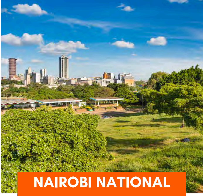
NAIROBI NATIONAL PARK