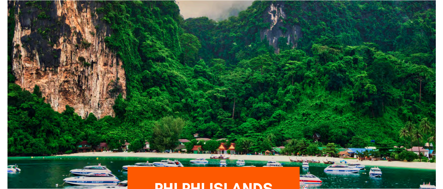
PHI PHI ISLANDS